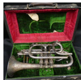
Consignment Page 10