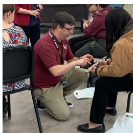
How We Help Page 2