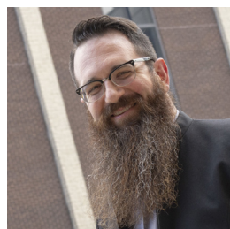
Spotlight Page 8